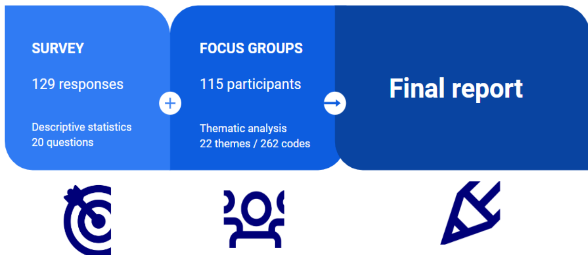
Figure 2- Mixed methods research interpretation

The focus group transcripts were subjected to thematic analysis, a method of identifying key content from interview transcripts and organising it into themes (Braun & Clarke, 2006). Thematic analysis involves segmenting, categorising, summarising, and reconstructing qualitative data to capture important concepts (Given, 2008). The analysis was carried out using ATLAS.ti 23, a software suite designed for analysing large amounts of textual, graphic, and video data. The analysis followed the recommended steps for thematic analysis posed by Friese et al. (2018), incorporating an iterative validation process to ensure reliability (Creswell, 2009). This process involved validating the codes through discussions among the authors. Additionally, descriptive statistics were utilised to analyse the survey data (Babbie, 2016). The analysis follows a hybrid approach starting with an initial code map guided by the questionnaire's questions, which evolved once we coded the text and identified 262 new relevant codes. Figure 2 shows the mixed method procedure carried out for the research.